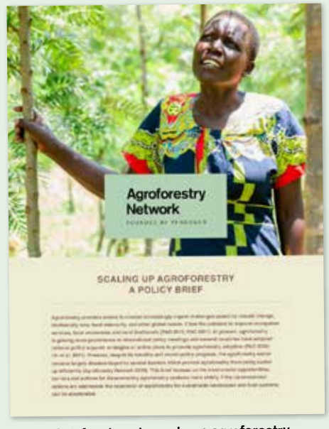
Policy brief on how to scale up agroforestry by Agroforestry Network.

■ In 2022, Agroforestry Network – a network founded by Vi Agroforestry – released two appreciated policy briefs. One was about how young people can overcome challenges to engage in agroforestry, and the other one contained recommendations on how to scale up agroforestry. The release events were shown live online, and included panel discussions with young farmers and scientists from Africa meeting representatives from the Swedish International Development Cooperation and FAO.